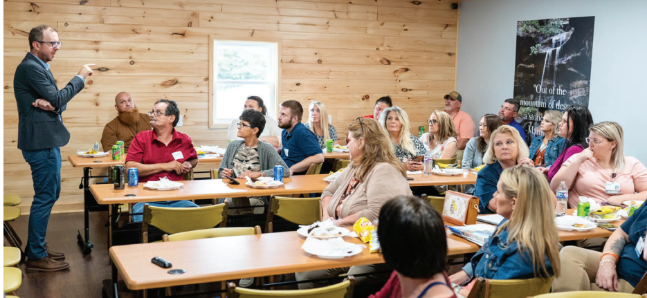
Kentucky Comeback Tour visit to Irvine in partnership with Isaiah House