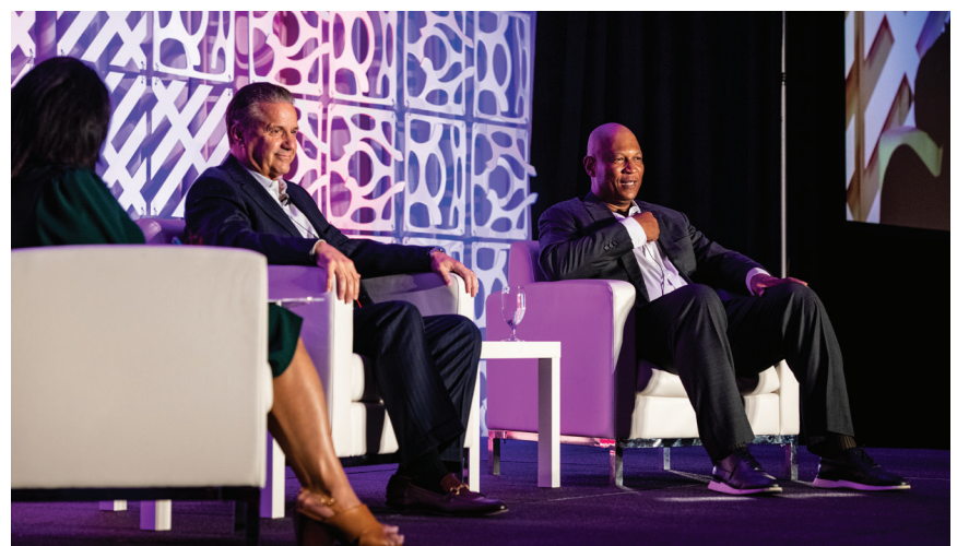
University of Kentucky Men's Basketball Coach John Calipari and University of Louisville Men's Basketball Coach Kenny Payne at the Kentucky Chamber's 2022 Annual Meeting Dinner

"The one thing we have to remember is that it's not on this man (Calipari) to bring the rivalry, it's on us. It's on the University of Louisville. The state is only going to be as good as we both are. And that's one reason I took this job. We need the rivalry to not only be intense and competitive, but also respectful so that we can have both schools and the state on top." Payne said.