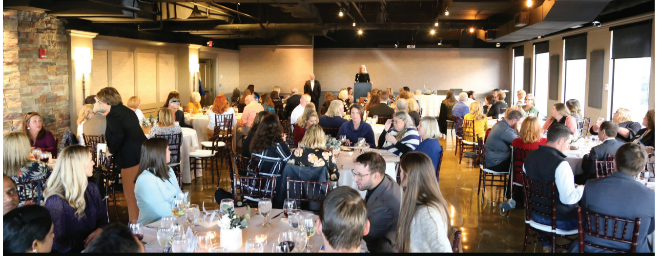
Local chambers from across the state met at the Kentucky Chamber of Commerce Executives Annual Conference and Awards Dinner in September

For address changes and subscription information, call 502-848-8723.