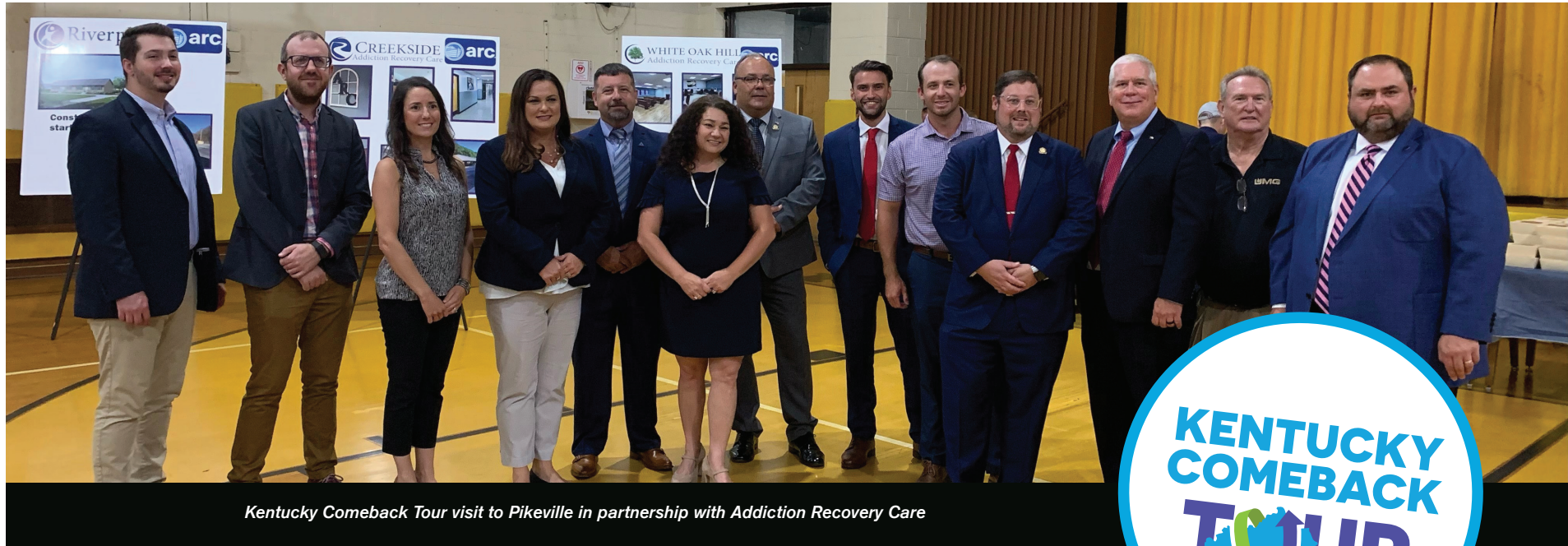
Kentucky Comeback Tour visit to Pikeville in partnership with Addiction Recovery Care