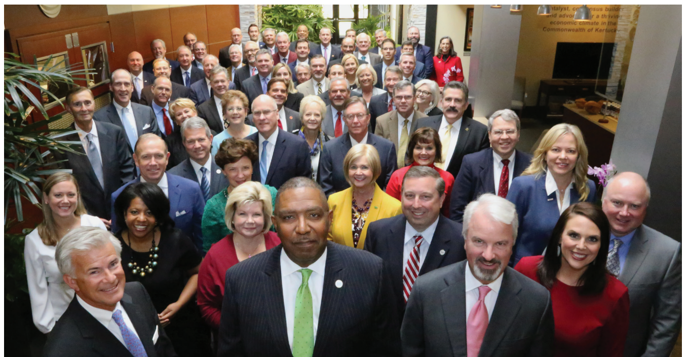
Pictured above: Kentucky Chamber's 2020 Board of Directors.