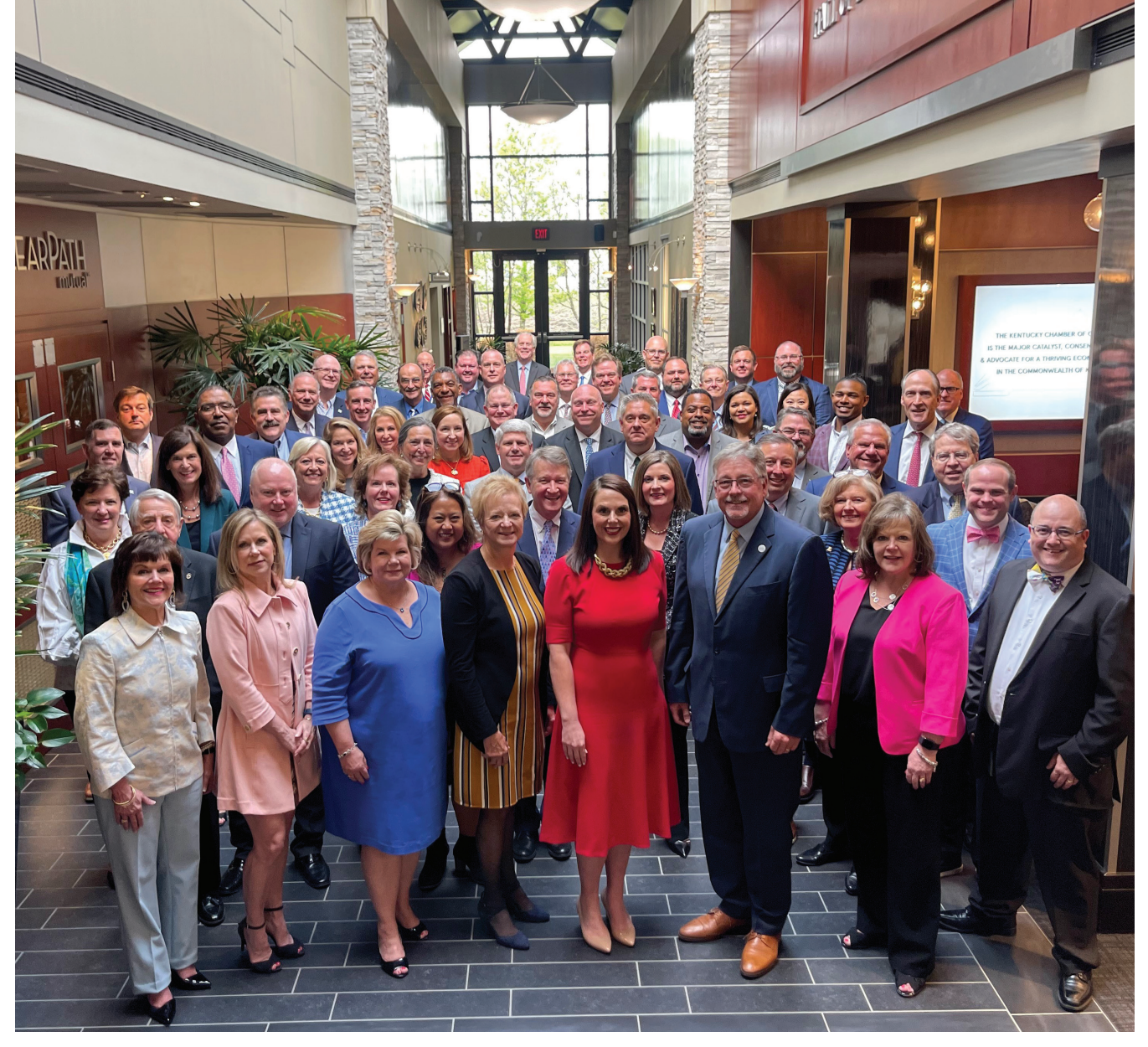
Pictured above: Kentucky Chamber's 2023 Board of Directors.

For address changes and subscription information, call 502-848-8723 .