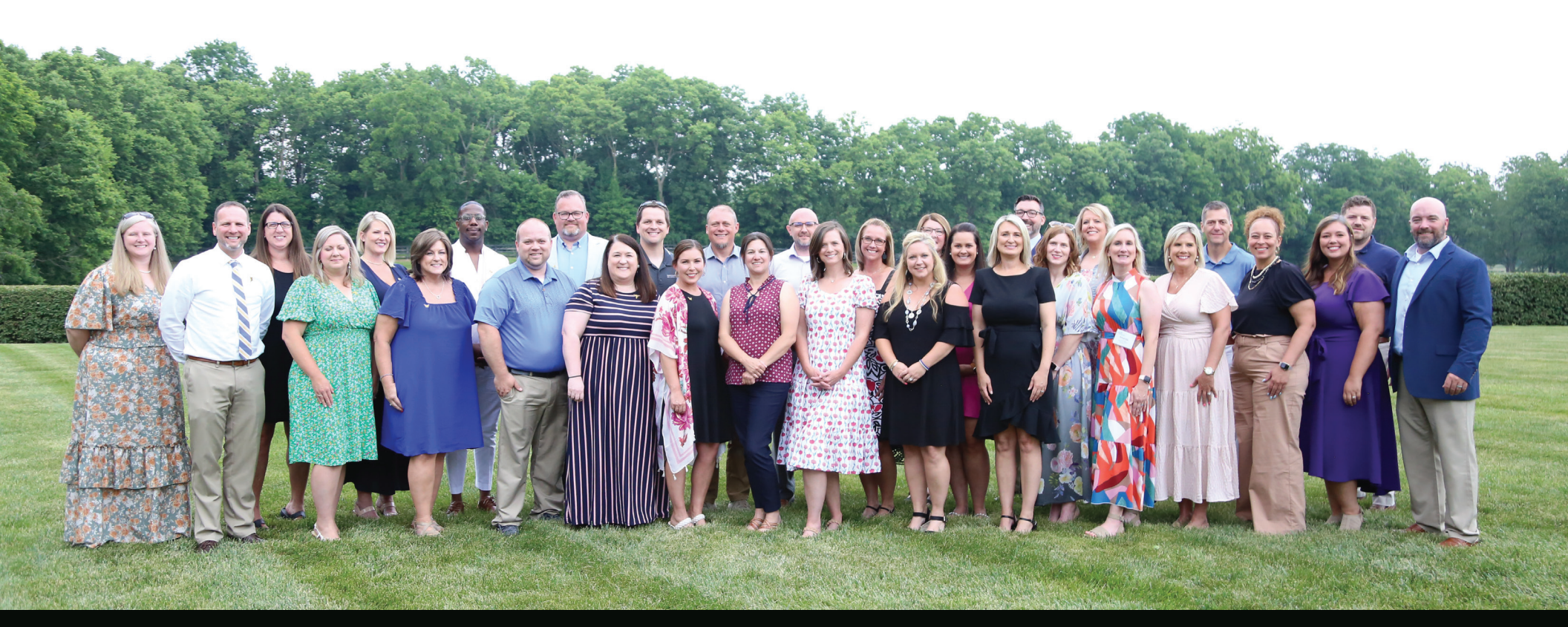
In June, the Foundation hosted a graduation ceremony for the Leadership Institute for School Principals Class of 2023