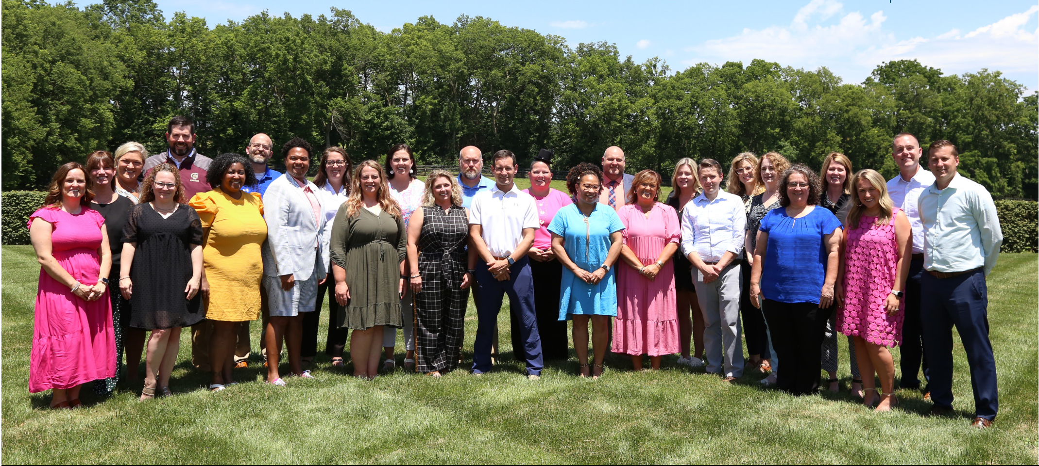
In June, the Foundation hosted a graduation ceremony for the Leadership Institute for School Principals Class of 2024