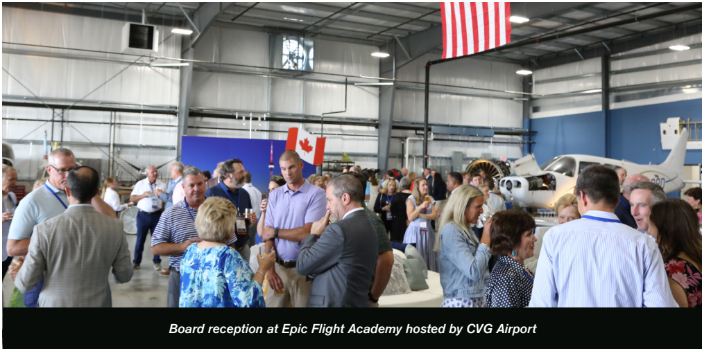
Board reception at Epic Flight Academy hosted by CVG Airport