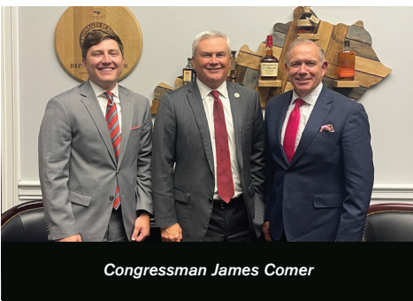
Congressman James Comer