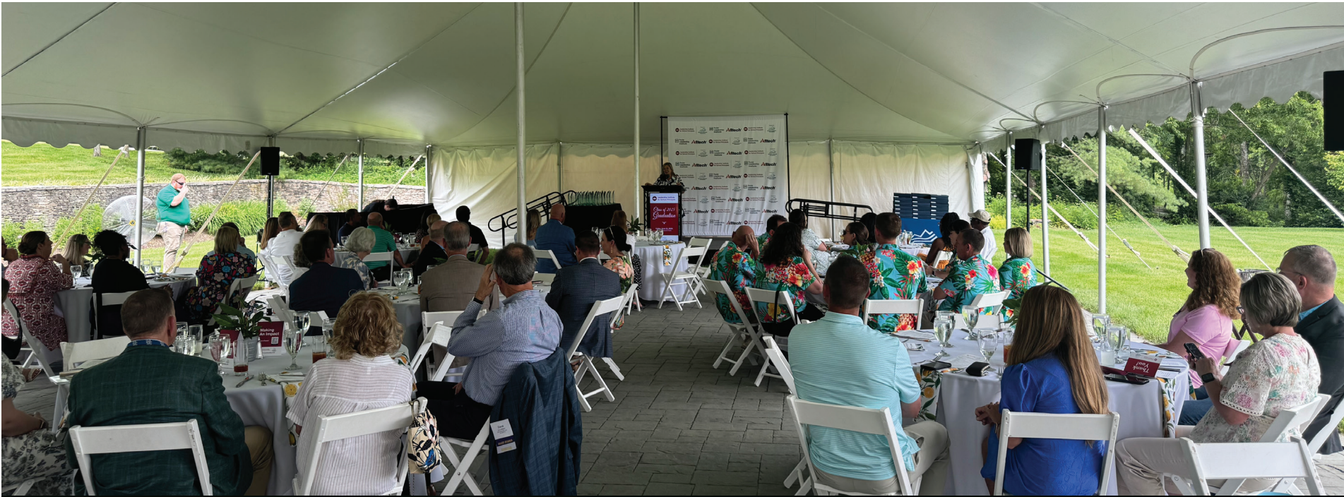
In June, the Foundation hosted a graduation ceremony for the Leadership Institute for School Principals Class of 2025