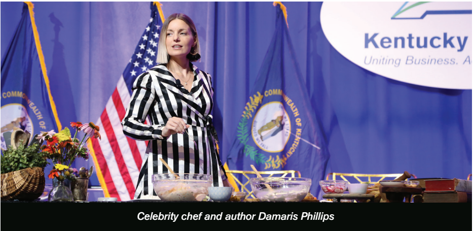
Celebrity chef and author Damaris Phillips