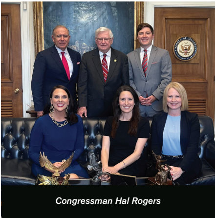
Congressman Hal Rogers