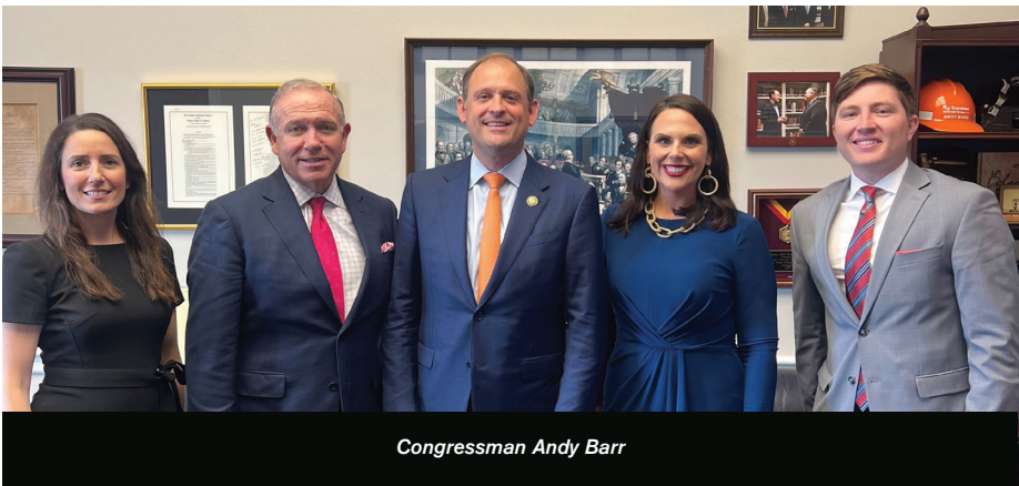
Congressman Andy Barr