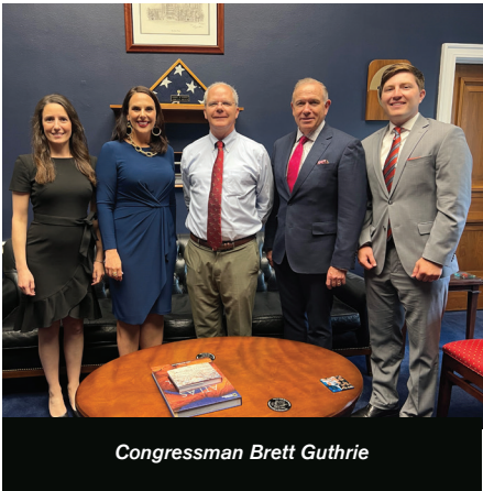
Congressman Brett Guthrie