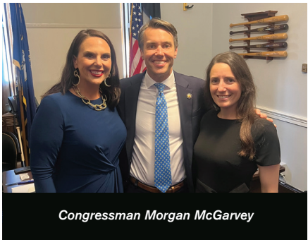
Congressman Morgan McGarvey