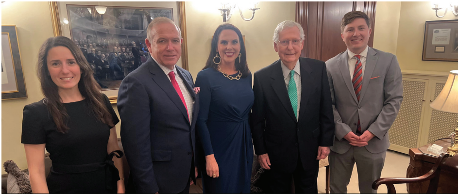
Senator Mitch McConnell