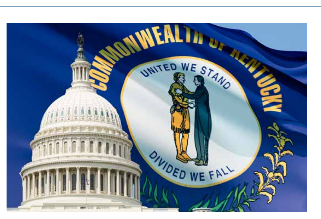
CONGRESSIONAL FORUM | AUGUST 29, 2016 | THE GALT HOUSE | LOUISVILLE