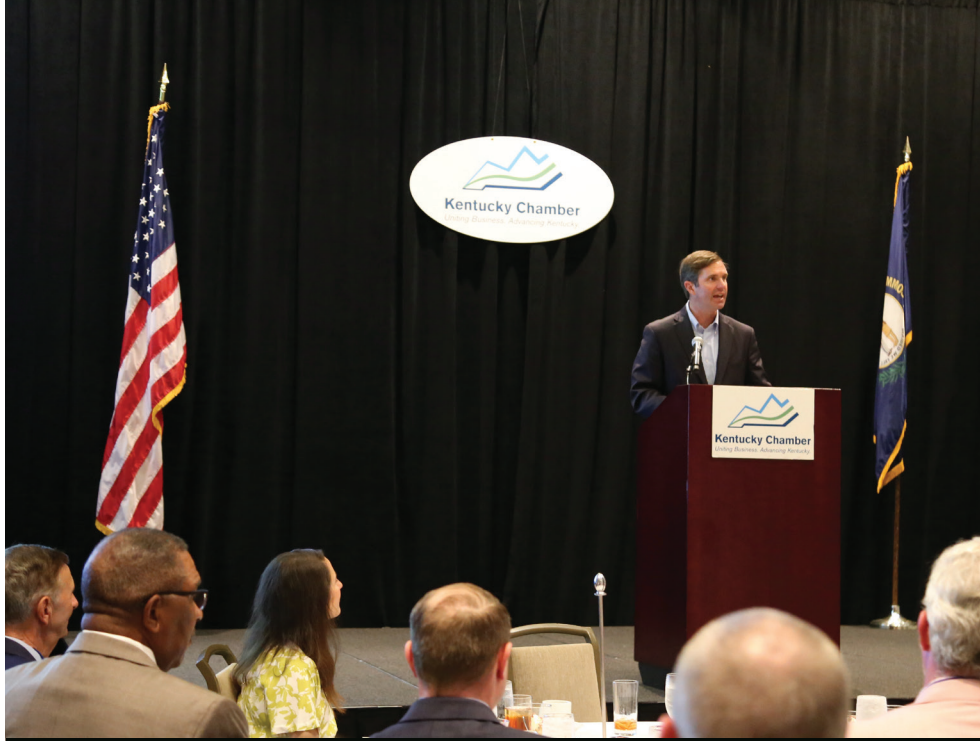
Governor Andy Beshear addresses Kentucky Chamber members at Public Affairs Forum, presented by Brown-Forman Corporation