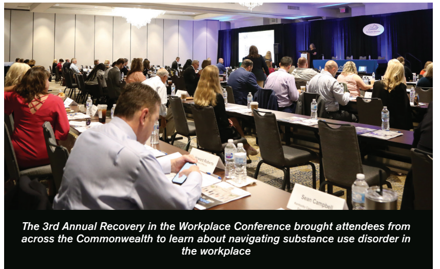
The 3rd Annual Recovery in the Workplace Conference brought attendees from across the Commonwealth to learn about navigating substance use disorder in the workplace

Kentucky U.S. Senator Mitch McConnell spoke with RunSwitch PR Co-Founder and CNN contributor Scott Jennings at the conference about the work happening at the federal level to combat this epidemic. He pointed to current realities the country faces coming out of the pandemic and emphasized the importance of people getting back to work, especially those struggling with substance use disorder.