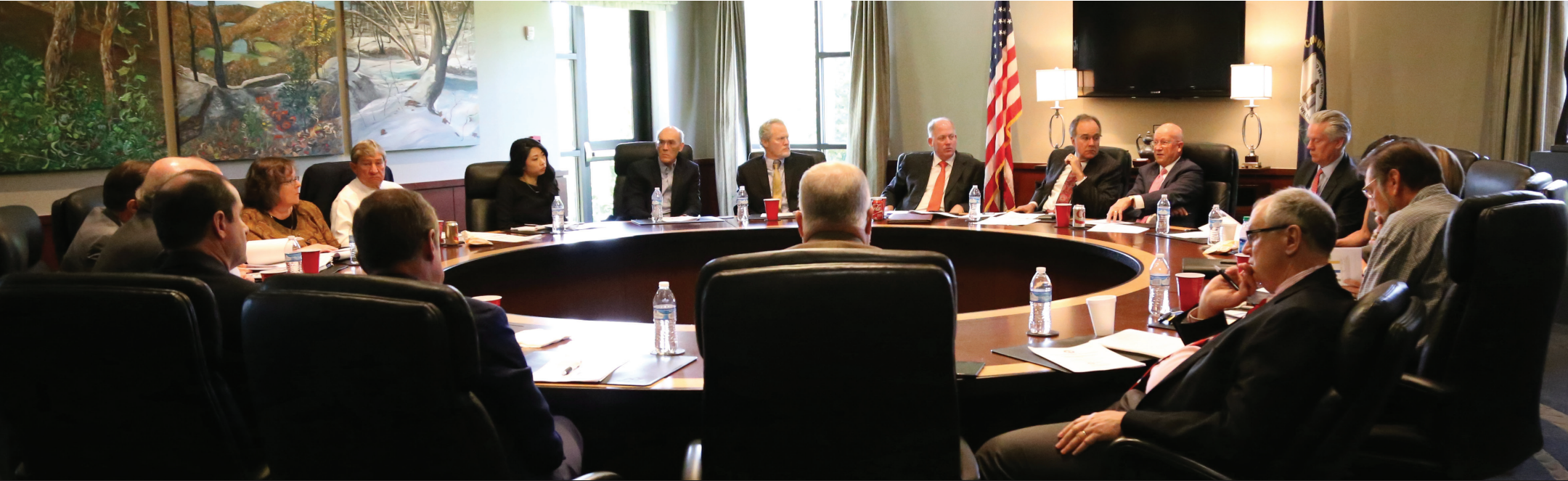
Pictured Above: Kentucky Chamber's Pension Task Force has been meeting for over a year, monitoring Kentucky's pension crisis and helping craft Chamber policies.