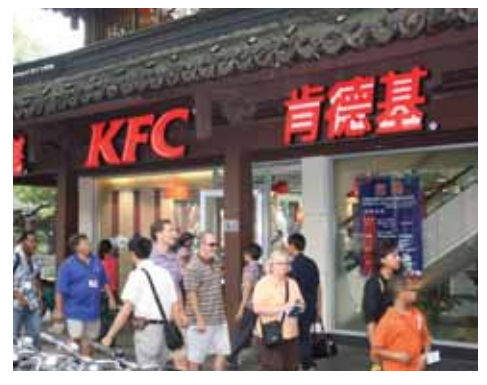
In 2010, delegates attending the Chamber's first Mission to China visited KFC in Shanghai. Yum! Brands is one of several Kentucky companies that has made a significant impact in China.

A nonrefundable deposit of $200 is due with your registration and will be applied toward the total cost of your trip. The dead-