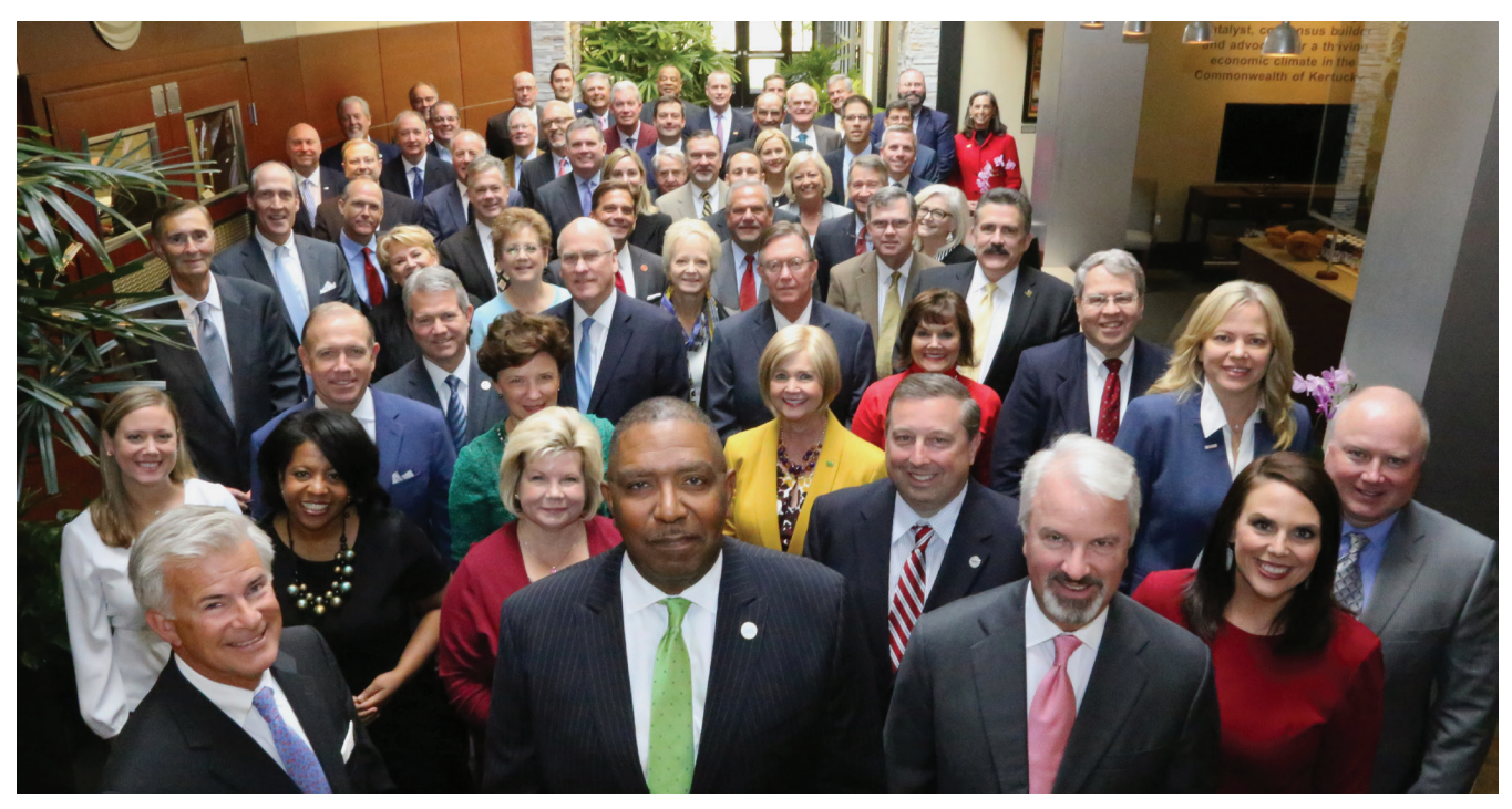
Pictured above: Kentucky Chamber's 2020 Board of Directors.