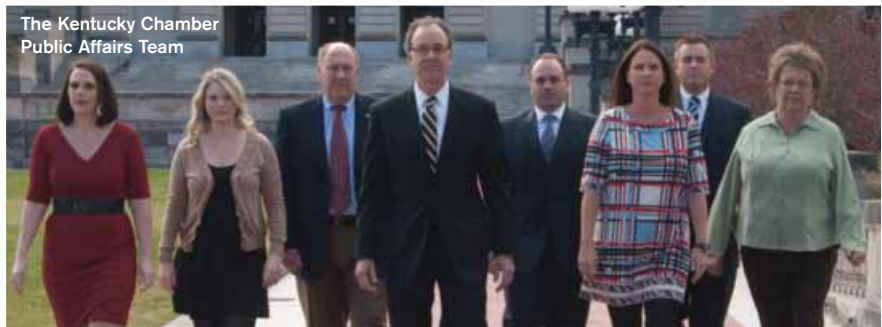
The Kentucky Chamber Public Affairs Team