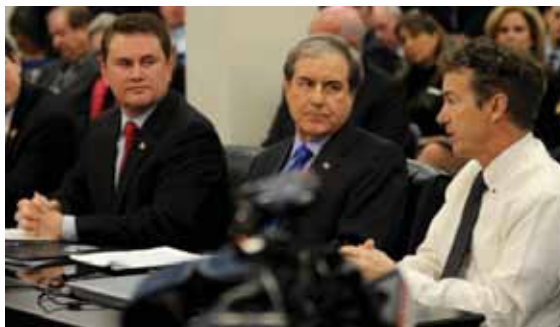
Agriculture Commissioner James Comer, Congressman John Yarmuth & U.S. Senator Rand Paul in committee.