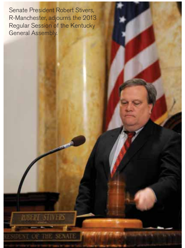
Senate President Robert Stivers, R-Manchester, adjourns the 2013 Regular Session of the Kentucky General Assembly.