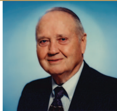
Cal Turner Dollar General Corporation (posthumous)