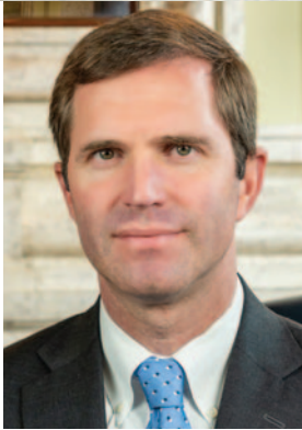
GOVERNOR ANDY BESHEAR