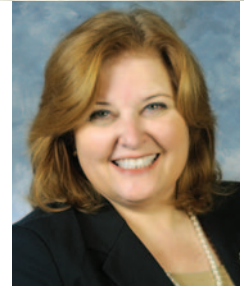
JONI JENKINS HOUSE MINORITY FLOOR LEADER