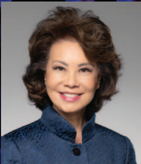
KENTUCKY CHAMBER 2022 WOMAN IN LEADERSHIP